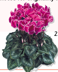
2595 Halios CURLY® Purple with edge

Ø plant : 9.5 to 20'' Ø pot : 5.5 to 8.5''