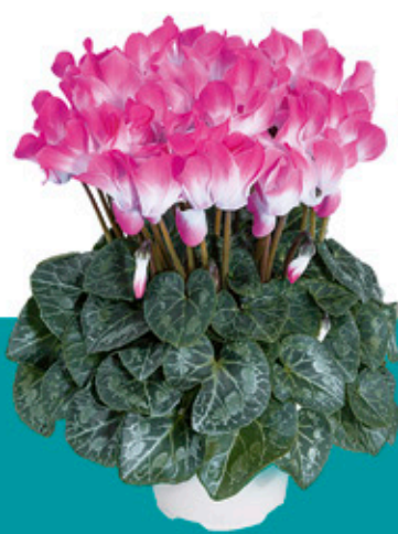
INDIAKA® Rose - 53070 -