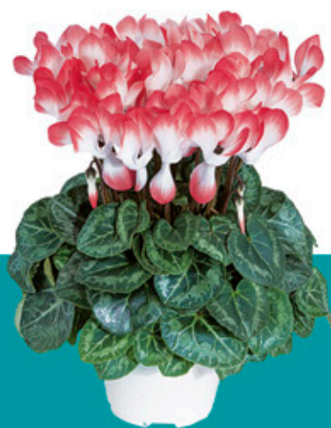
INDIAKA® Salmon - 53030 -