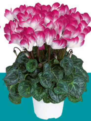
INDIAKA® Magenta - 53105 -