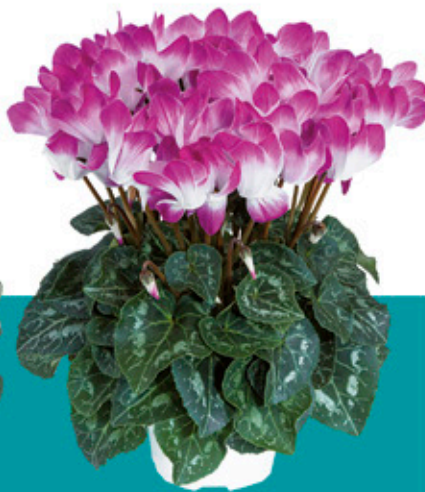
INDIAKA® Bright purple - 53090 -