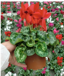
Latinia® SUCCESS® 5" (12 cm) pots In the Netherlands, in October