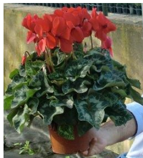
Latinia® SUCCESS® 6" (15 cm) pots in Italy, in September

Choosing the variety that is adapted to the thermal conditions of your greenhouses allows you to: