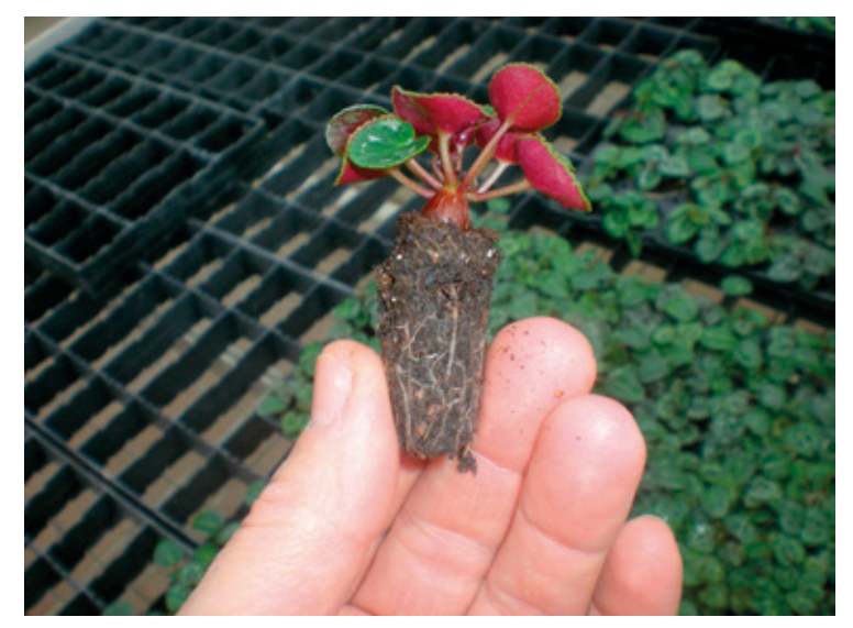
transplanted young plant