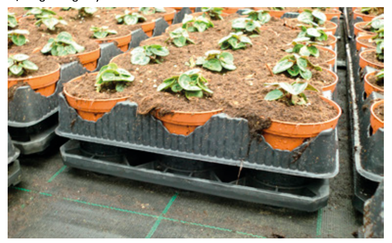
Good rooting helped by the lifted tray