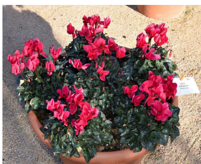
5071 MIDI+® Deep rose