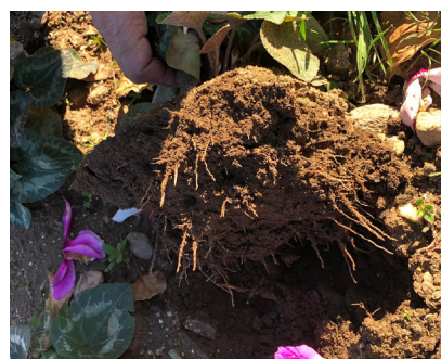
Roots of MIDI + ® in our beddings in Fréjus at the end of November (Week 47)