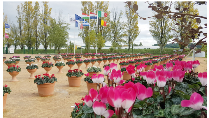
Outdoor trials, Morel Cyclamen, Fréjus INDIAKA® in the foreground

To obtain this label, a minimum score of 7/10 is necessary.