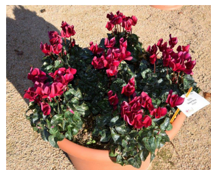
5095 MIDI+® Purple