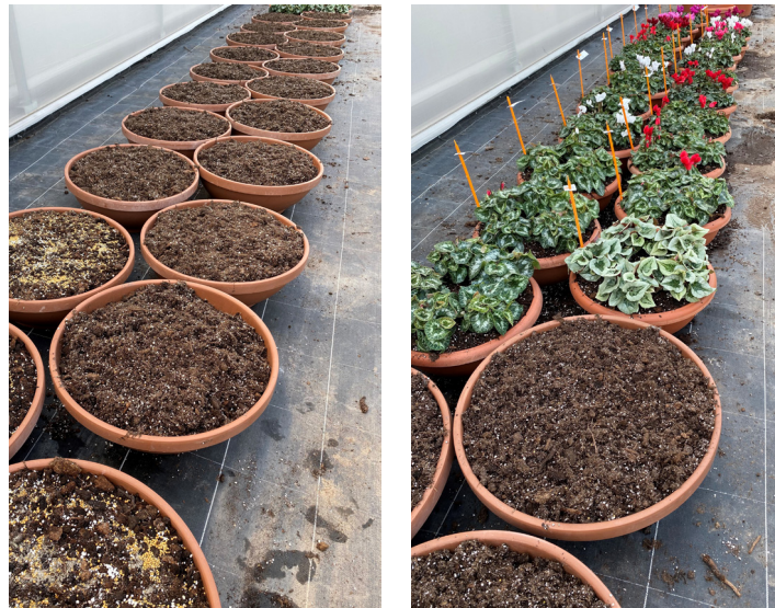
Preparation of the planters

Slow-release fertilizer “3-4 months” is incorporated into the substrate with a balance of 11-11-18. This facilitates rooting and also prevents leaching of fertilizer during periods of heavy rains. It is strongly recommended to mix the fertilizer as evenly as possible.