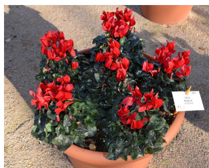
5011 MIDI+® Bright red

Midi+® standard colours are not available in the USA and Canada. Corresponding substitution: Dreamscape (Pan American Seed distributed through Ball Seed).